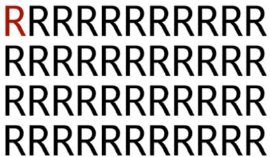
Motif and Pattern